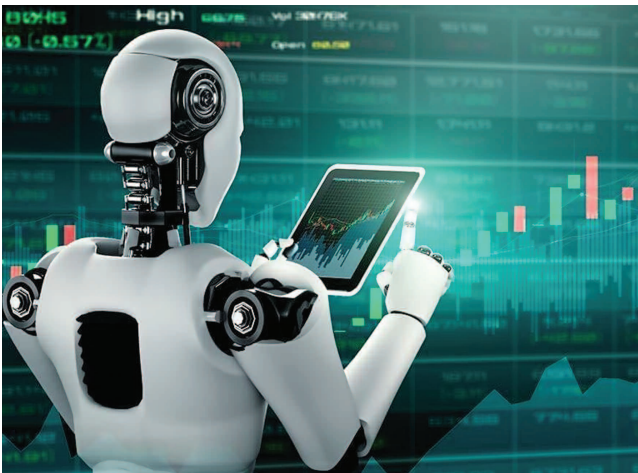
The UAE has witnessed a 40% increase in AI professionals since 2022, reinforcing its position as a leading hub for AI talent and expertise

The UAE is strengthening its position as a global leader in Artificial Intelligence (AI) by implementing comprehensive strategies that foster innovation, investment, and supportive legislation. With its advanced infrastructure, adaptive regulatory frameworks, and policies that promote technological advancement, the country continues to attract top AI talent and emerging startups. While the UAE's vision for AI extends beyond economic gains, the technology is expected to significantly impact the economy. The country is projected to rank third globally, after China and the US, in AI's contribution to the economy. A report by PwC estimates that AI will contribute approximately 13.6% to the UAE's GDP, amounting to around $100 billion by 2030. Additionally, AI's contribution to regional economies is expected to grow between 20%