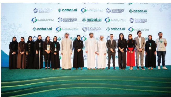
The collaboration between EAD and Nabat underscores Abu Dhabi's commitment to integrating AI and robotics across diverse sectors, including environmental conservation

The partnership's primary focus is to deploy advanced AI-