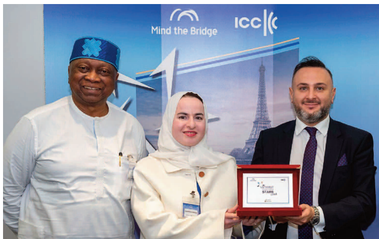
DoH has supported 80 healthcare startups since 2021, leading to the creation of 926 specialised jobs and fostering economic growth

Central to DoH's success in driving healthcare innovation is its flagship HealthX accelerator, developed in partnership with New York University Abu Dhabi (NYUAD) and startAD. The programme provides startups with access to world-class facilities, expert mentorship, and pilot opportunities, enabling the seamless tran-