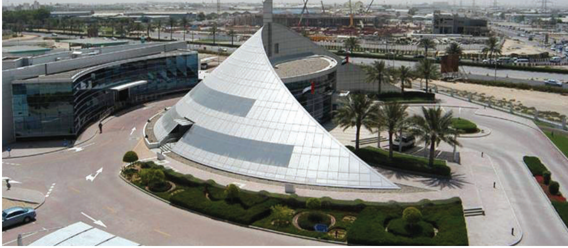
The General Civil Aviation Authority's digital platform for implementing 'CORSA' ensures data confidentiality and ease of use for UAE carriers —WAM

This digital platform plays a pivotal role in implementing CORSA by streamlining the calculation of offset and reduction values for carbon units used by national carriers. CORSA provides a structured framework to minimise international aviation emissions while accounting for the unique circumstances and capabilities