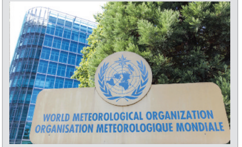
Greenhouse gas levels continue to rise to record observed highs, locking in even more heat for the future, according to the WMO

WMO stated that in 2025, there will be a strong focus on the cryosphere - the frozen parts of the Earth including sea ice, ice sheets, frozen ground – as it is the International Year of Glaciers’ Preservation, facilitated by UNESCO and WMO.