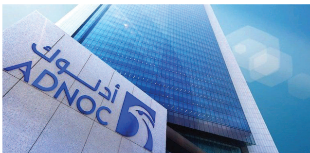
Adnoc's In-Country Value (ICV) programme has delivered AED242 billion in economic value and enabled the employment of 17,000 Emiratis in the private sector since its launch in 2018

In 2024, Adnoc's ICV programme reinvested AED55 billion into the UAE's economy and facilitated the creation of 5,500 private-sector jobs for UAE nationals in collaboration with the Emirati Talent Competitiveness Council (Nafis). Since its launch in 2018, the