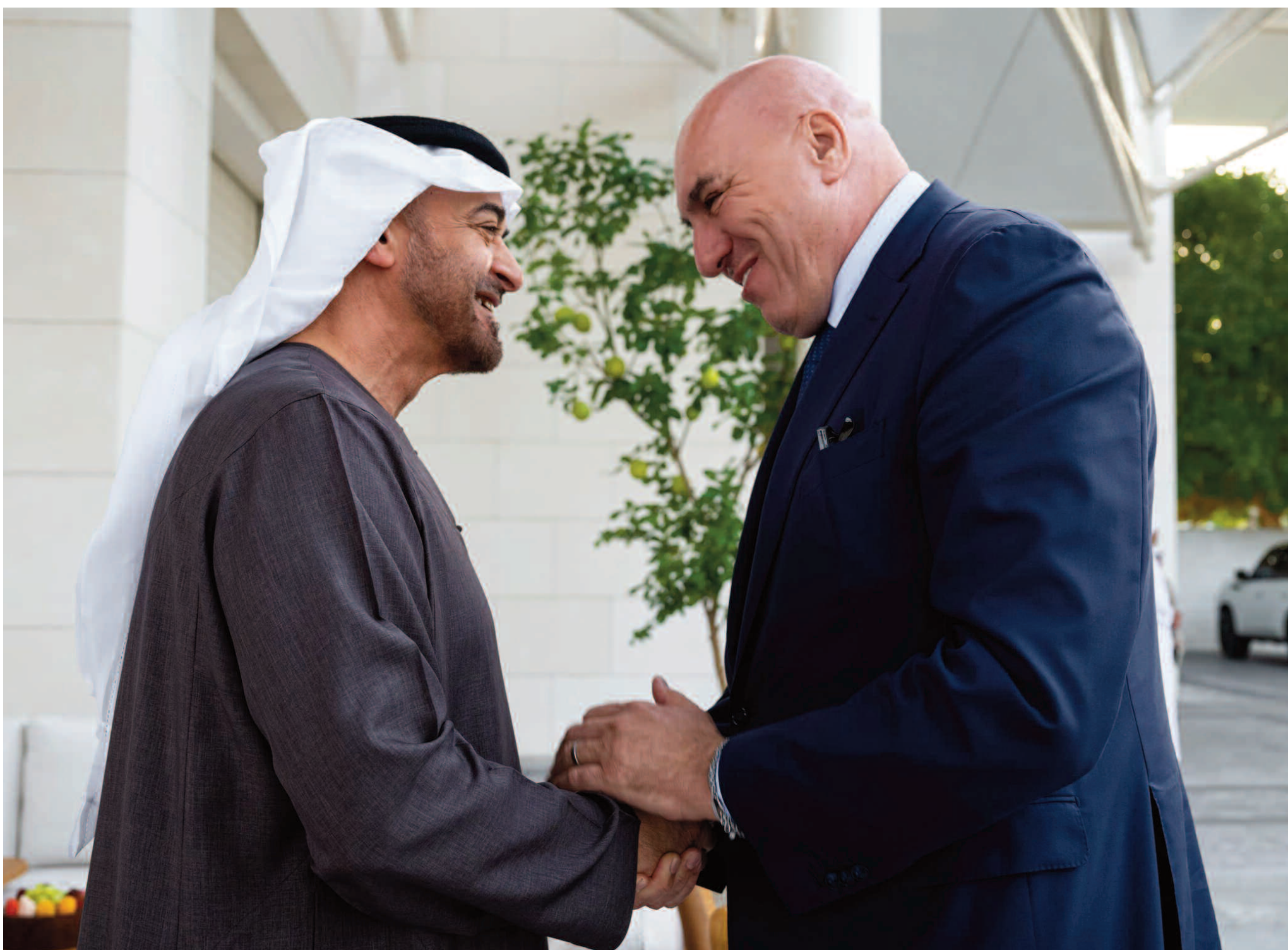
UAE President His Highness Sheikh Mohamed bin Zayed Al Nahyan with His Excellency Guido Crosetto, Minister of Defence of the Italian Republic, at Qasr Al Shati in Abu Dhabi on Monday