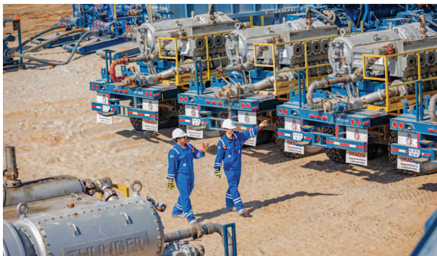
To service the AED6.24 billion contract awarded by Adnoc and explore future opportunities in unconventional resources, the Adnoc Drilling has incorporated a new entity, Turnwell Industries