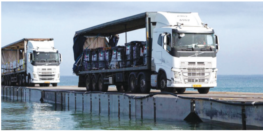
The UAE's aid shipment was facilitated with the joint cooperation of the UAE, the US, Cyprus, the UN, and international donors including the UK and the EU

Reem bint Ebrahim Al Hashimy, Minister of State for International Cooperation, has announced the arrival of a shipment of food aid for the brotherly people of Gaza, intended for the northern Gaza Strip. The shipment, which arrived via the maritime corridor from Larnaca in the Republic of Cyprus, was facilitated with the joint cooperation of the UAE, the US, Cyprus, the United Nations, and international donors including the United Kingdom and the European Union.