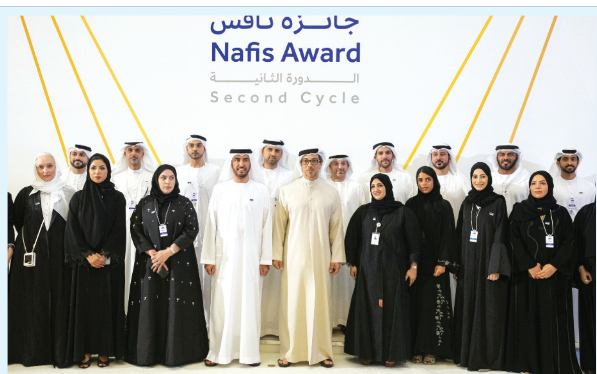
HH Sheikh Mansour bin Zayed Al Nahyan, Vice President, Deputy Prime Minister, Chairman of the Presidential Court, and Chairman of the Board of Directors of the Emirati Talent Competitiveness Council, while honouring winners of the Nafis Award, at Qasr Al Watan in Abu Dhabi