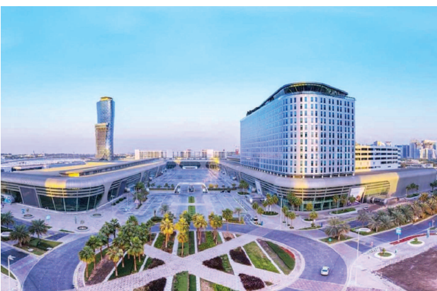
In 2023 alone Adnec Group hosted 282 events and welcomed 1.5 million visitors

As the largest events venue in the Middle East with over 153,000 square metres, Adnec Centre Abu Dhabi is a world-class venue with a wide variety