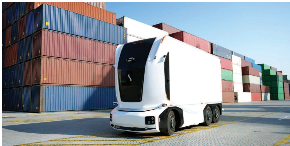
Jebel Ali Port was recently ranked as the 10th busiest container port in the world by Alphaliner, a leading source of data, analysis, and insights on the global liner shipping industry, based on total container throughput in 2023

“Einride and DP World are driving a paradigm shift in the landscape of freight mobility in the Middle East. Our collaboration underscores a shared dedication to sustainability and