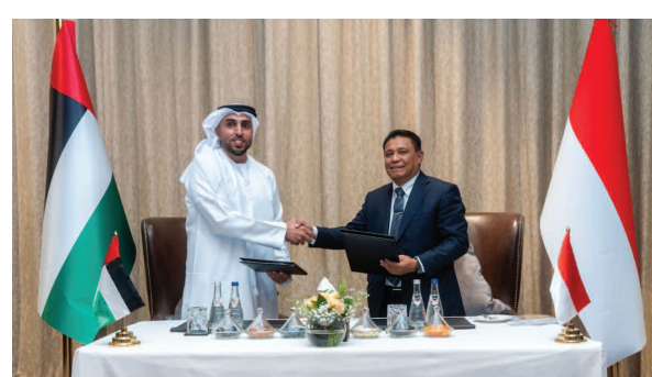
The visit and agreement are part of an ongoing effort between the UAE and Indonesia to increase bilateral trade to $10 billion by 2030 under the Comprehensive Economic Partnership Agreement

The agreement is for the production of 5.56x45mm and 7.62x51mm calibre ammunition. It was signed in the presence of the Indonesian president-elect and Minister of Defence Lt General (Ret) Prabowo Subianto, during an official