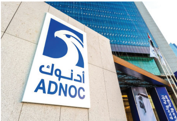
Adnoc is an early mover in the production of hydrogen and it aims to capture 5 percent of the global low-carbon hydrogen market by 2030 in support of the UAE's National Hydrogen Strategy —WAM

The cargo, sourced from Fertil, Fertiglobe's 100-percent-owned facility located in the Ruwais Industrial City, Abu Dhabi, will see the carbon dioxide (CO2) captured and permanently stored in the world's first fully sequestered CO2 injec-