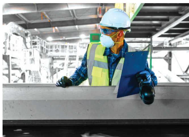
The Material Recovery Facility will be developed as part of the Tadweer Group's circular cluster, which will ensure minimal waste ends up in landfills

The MRF will be developed as part of the organisation's circu-