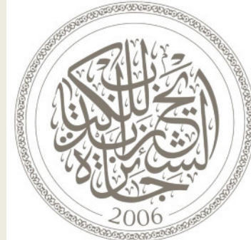
جائزة الشيخ زايد للكتاب Sheikh Zayed Book Award

Submitted books must have an International Standard Book Number (ISBN) to verify property rights. Resubmissions are accepted if they still