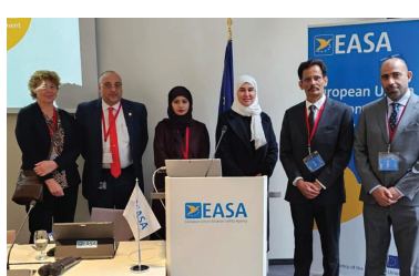
UAE delegation presented “Protocol to Enhance Global Aviation Safety and Public Health Resilience” during the Collaborative Arrangement for the Prevention and Management of Public Health Events in Civil Aviation (CAPSCA) Joint Meeting in Germany

The Protocol has garnered widespread acclaim from the International Civil Aviation Organisation (ICAO) and member states for its innovative approach to mitigating significant public health risks associated with air travel.