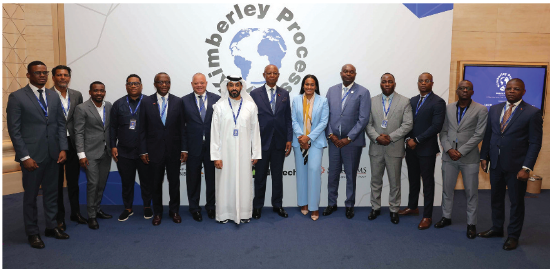
The KP intersessional opening saw a global gathering of hundreds of diamond industry representatives, civil society and world governments

"By enabling producers to extract the full value of their natural resources, the Kimberley Process has helped countries around the world, and particularly in Africa, use their diamond revenues to develop and