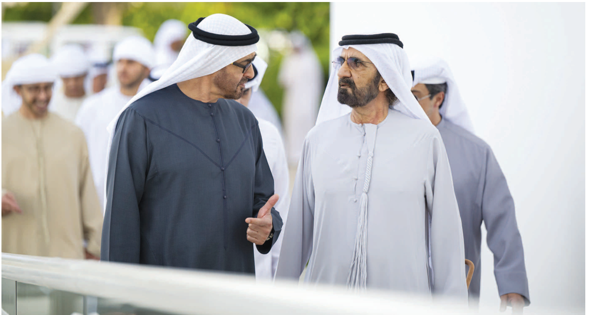
UAE President His Highness Sheikh Mohamed bin Zayed Al Nahyan with His Highness Sheikh Mohammed bin Rashid Al Maktoum, Vice President, Prime Minister, and Ruler of Dubai, at Qasr Al Bahr in Abu Dhabi on Tuesday