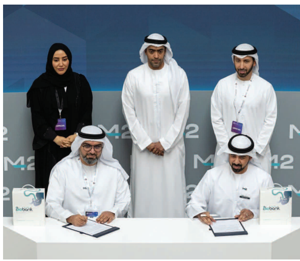
The newly launched Biobank service will be introduced across four leading healthcare entities committed to maternal and child health across Abu Dhabi

The service will be introduced across four leading healthcare entities committed to maternal and child health across Abu Dhabi. Prospective parents can avail themselves of this service at Danat Al Emarat Hospital for Women & Children, part of the M42 group, Corniche Hospital,