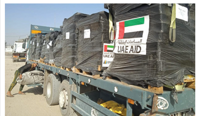
The UAE has delivered more than 31,000 tonnes of urgent humanitarian supplies, including food, relief and medical items for the brotherly people of Gaza, dispatched through 256 flights, 46 airdrops, 1,231 trucks, and six ships