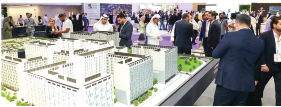
Spanning over an area of 6000 square meters, ACRES has successfully attracted major real estate development and investment companies, alongside top-tier property brokers, project management firms, banks, and financial institutions in the UAE

The exhibition will also showcase a diverse selection of residential, commercial, and industrial properties and land parcels, featuring exclusive