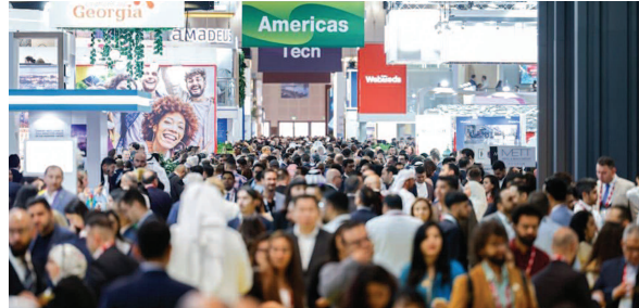
Arabian Travel Market 2024 will host the Market Insights Summit on the Global Stage on opening day, exploring the potential of China, India and Latin America as they emerge as key players in global tourism