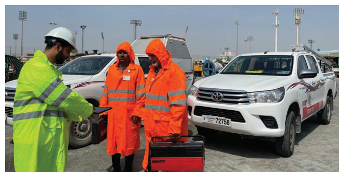
Sharjah Electricity, Water and Gas Authority conducted repair and maintenance operations in the central region, alongside electrical stations and transformers across all areas, to address the electrical faults resulting from the exceptional weather conditions.