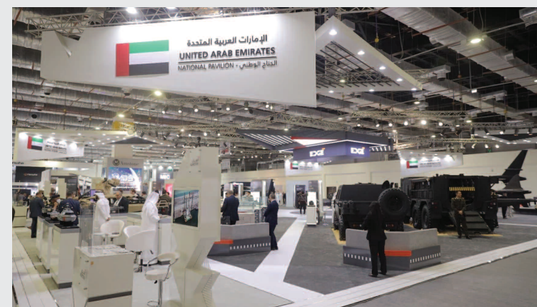
The Defense Services Asia (DSA) exhibition stands as one of the most prominent defence events in the region, bringing together 1,200 of global companies specialising in the defence and security sector from over 60 nations.

THE INSURANCE segment of PureHealth recorded a revenue increase of 13% YOY to AED1.6 billion in Q1 2024