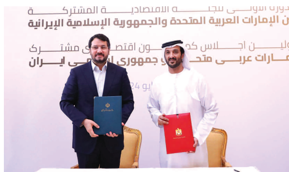
Abdullah bin Touq Al Marri, Minister of Economy, with Mehrdad Bazrpash, Minister of Road and Urban Development of Iran, during the first session of the Joint Economic Committee (JEC) in Abu Dhabi on Thursday

The session, which was attended by several government officials from both sides, explored the strengthening of cooperation in many economic sectors of mutual interest. These include the new economy, tourism, transport, entrepreneurship, energy and renewable energy, SMEs, innovation, logistics, agriculture and environment. The meeting also discussed the means to support joint efforts needed to elevate bilateral economic relations to new heights. Bin Touq noted