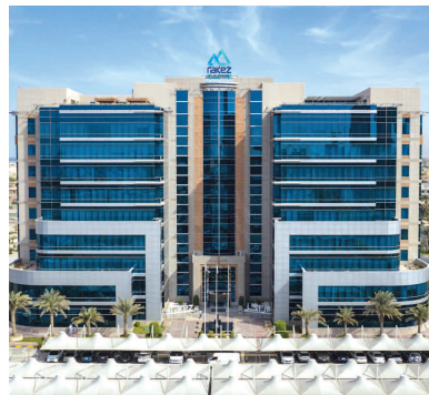
Rakez's active participation in global events highlights its crucial role as a facilitator of international business and economic development —WAM

The discussions highlighted Ras Al Khaimah as a dynamic hub for key industries such as tourism, manufactur-