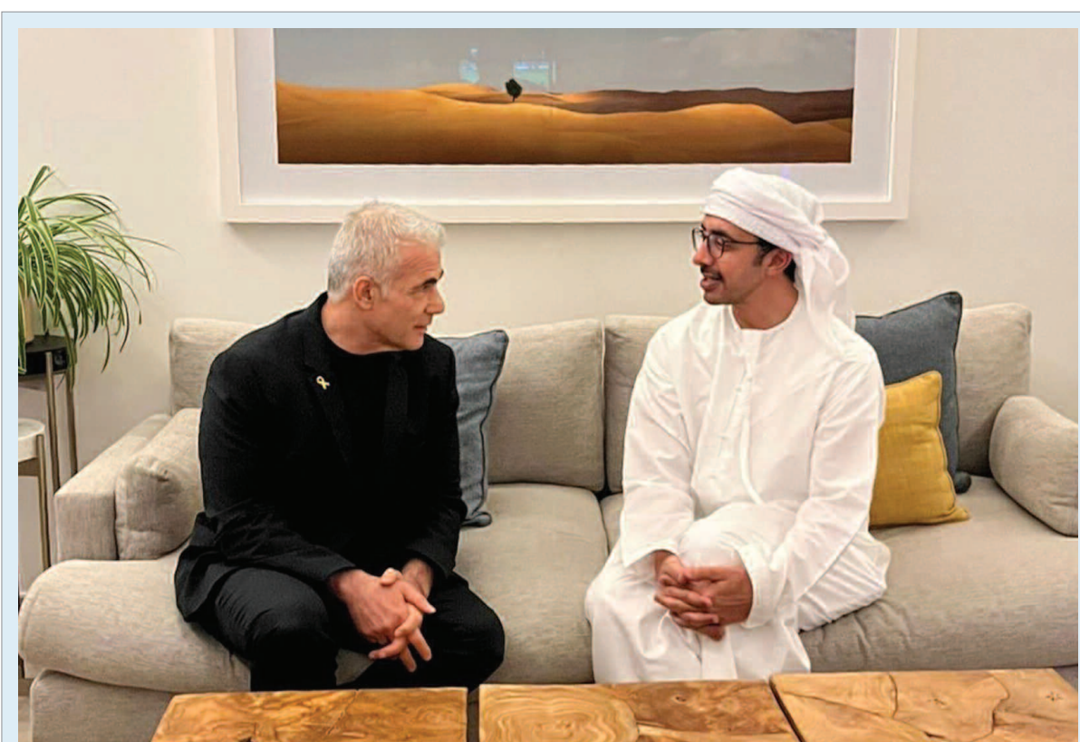
His Highness Sheikh Abdullah bin Zayed Al Nahyan, Minister of Foreign Affairs, with Yair Lapid, Leader of the Opposition in Israel, in Abu Dhabi on Thursday. The leaders discussed latest developments in the region, particularly the deteriorating humanitarian crisis in the Gaza Strip.