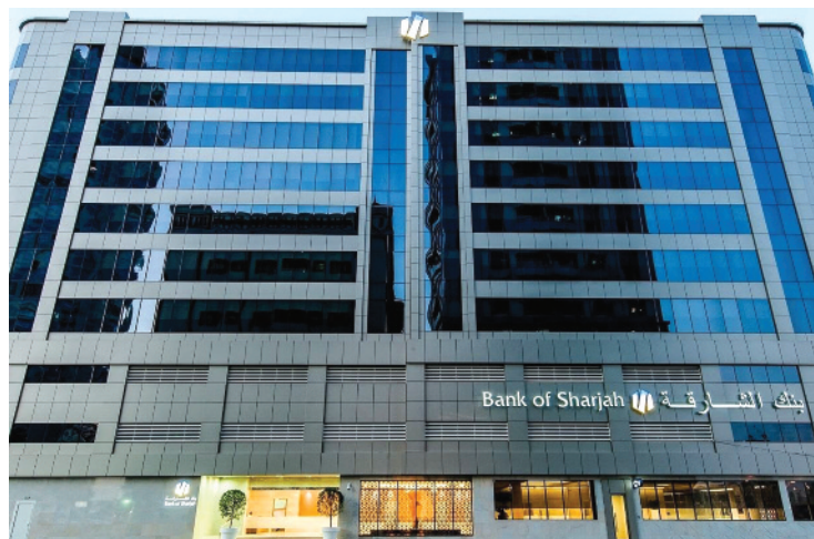
The Bank of Sharjah's robust metrics result from strict adherence to a focused approach to funding, lending, and operational effectiveness —WAM

The bank reported strong capitalisation with a Regulatory Capital Adequacy Ratio of 14.33% (December 31, 2023: 14.67%) and Regula-