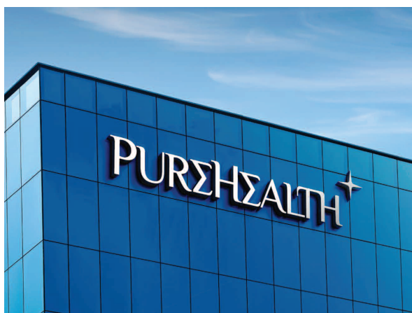
As of March 31, 2024, PureHealth reported total assets of approximately AED47 billion, up from around AED28 billion in Q1 2023, which includes a healthy total cash balance of AED8 billion. —WAM

PureHealth's EBITDA has increased to approximately AED1.1 billion, a 127% increase year-on-year, with the EBITDA margin for Q1