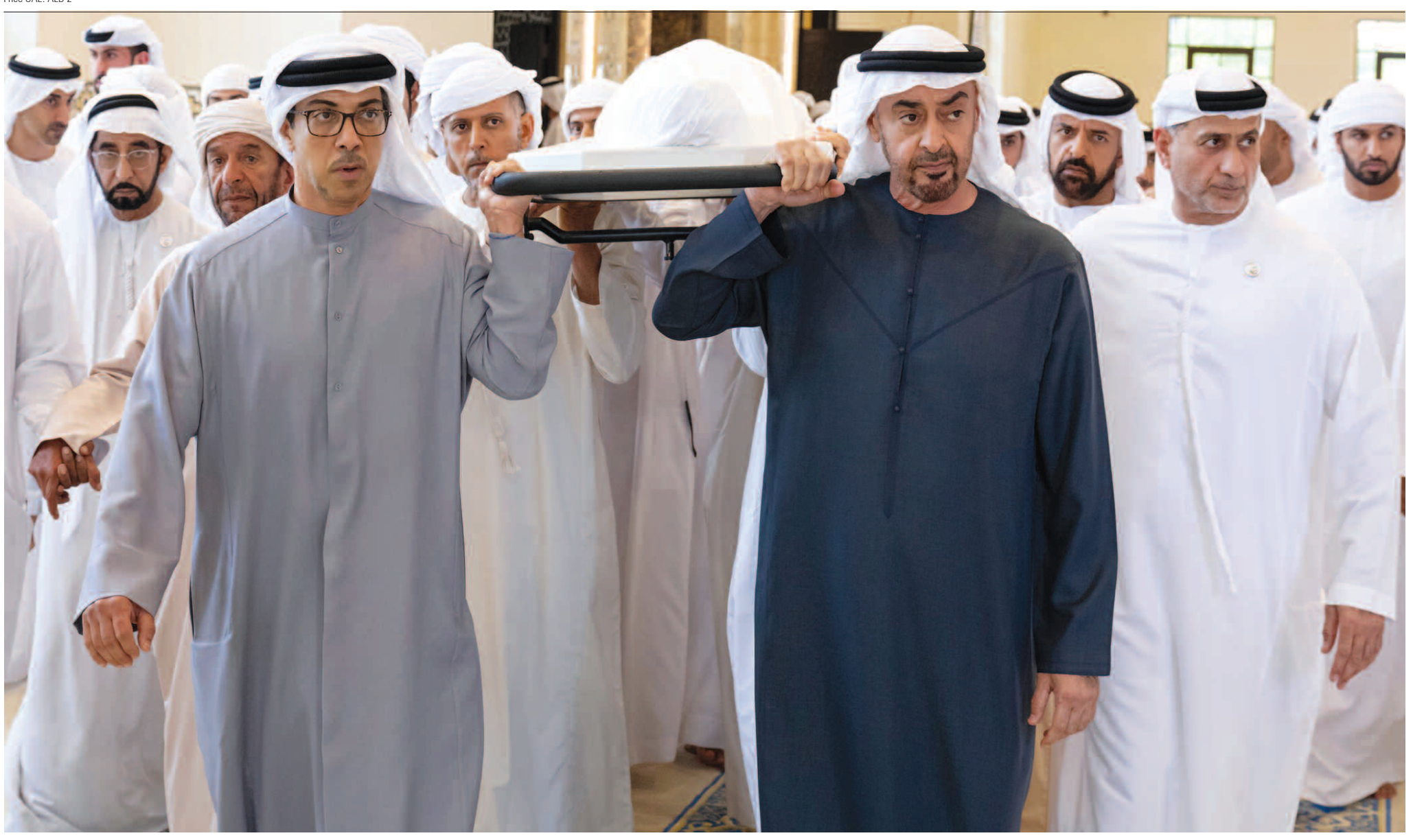
UAE President His Highness Sheikh Mohamed bin Zayed Al Nahyan while performing the funeral prayer over the late Sheikh Tahnoun bin Mohammed Al Nahyan at the Sheikh Sultan bin Zayed the First Mosque in Abu Dhabi on Thursday