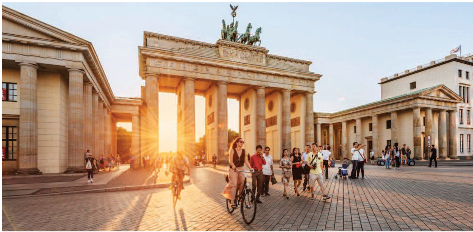
Taking place on May 4 and 5 at Palazzo Versace Dubai, this two-day event represents a pivotal opportunity for the European nations to showcase their unique attractions, forge strategic partnerships, and strengthen ties with GCC travel professionals

As the Discover Europe Travel Summit convenes, travel professionals will gain in-depth knowledge of Austria, Germany and Switzerland, by uncovering hidden gems and seasonal highlights, ensuring their clients experience the very best these captivating destinations have to offer year-round.