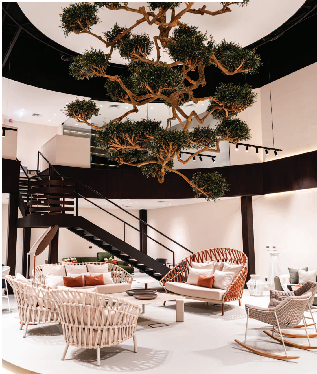
With the opening of CASAIRE in the UAE, it is the company's mission to offer the same dedication and success to the Middle East region, establishing formidable partnerships, while creating enduring relationships through exquisite selections and unparalleled service