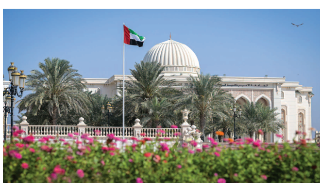
Positioning among the top 150 universities in Asia in the latest Times Higher Education achievement marks a significant advancement from American University of Sharjah's previous standing among the top 250 universities in Asia last year —WAM

“As we celebrate this significant achievement, we are proud of the progress we have