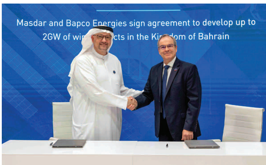
The clean energy collaboration between Masdar and Bapco Energies will support Bahrain to accelerate the decarbonisation of critical industrial sectors and open avenues to develop new market sectors —WAM

At up to 2GW, this clean energy collaboration will support Bahrain to accelerate the decarbonisation of critical in-