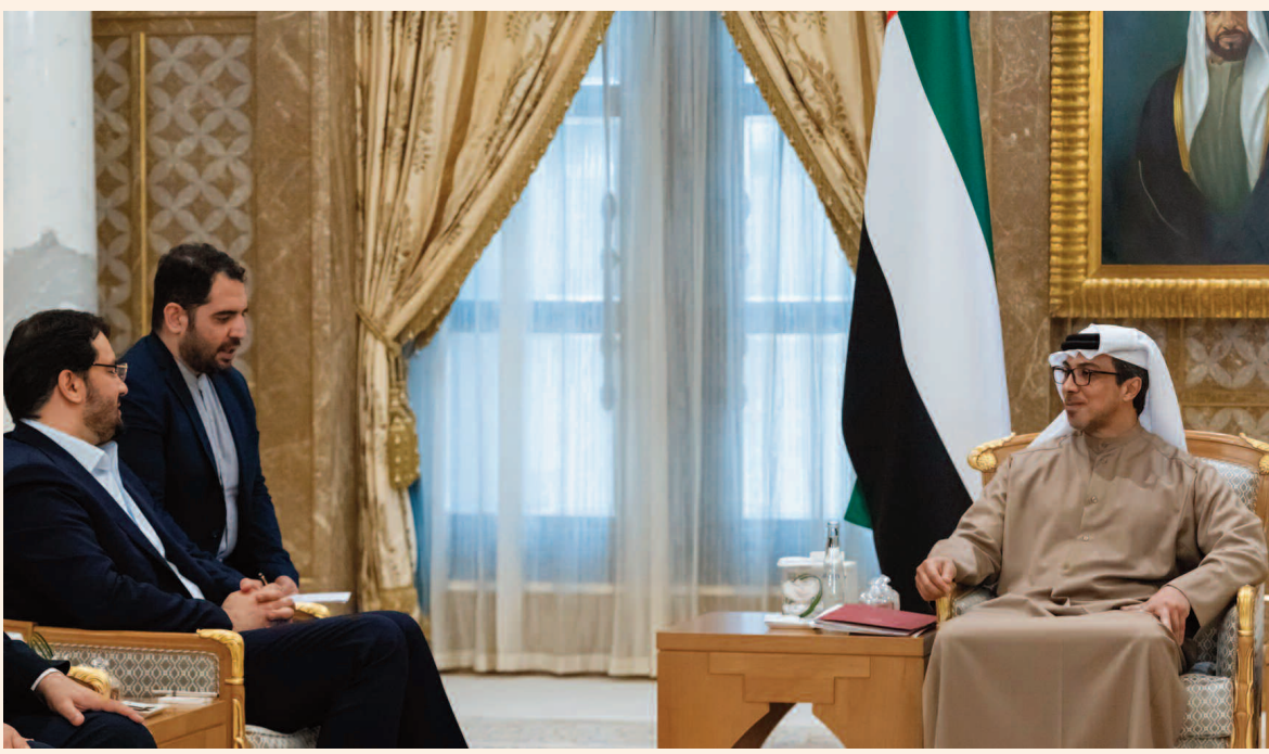
His Highness Sheikh Mansour bin Zayed Al Nahyan, Vice President, Deputy Prime Minister and Chairman of the Presidential Court, with Mehrdad Bazrpash, Minister of Road and Urban Development of the Islamic Republic of Iran, at Qasr Al Watan, Abu Dhabi, on Wednesday