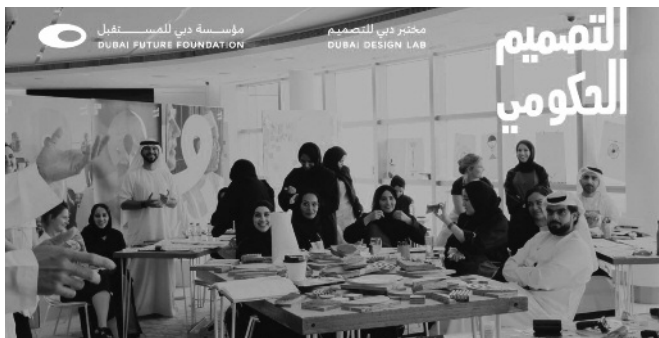
In second edition of the Dubai Future Foundation, participants will work in teams to test their new skills by building innovative concepts, designing future scenarios, prototyping government projects, and identifying entities to ensure they achieve their project goals

Held under the theme of "Leadership and Design", the programme will last for 14 weeks from July to October 2024. The programme will include workshops, meetings, and events locally and abroad.