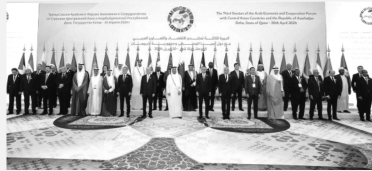
The third session of Arab Economy and Cooperation Forum, held in Doha, underlined the importance of supporting agricultural cooperation and benefiting from exceptional experiences in harnessing advanced agricultural technologies and smart irrigation systems