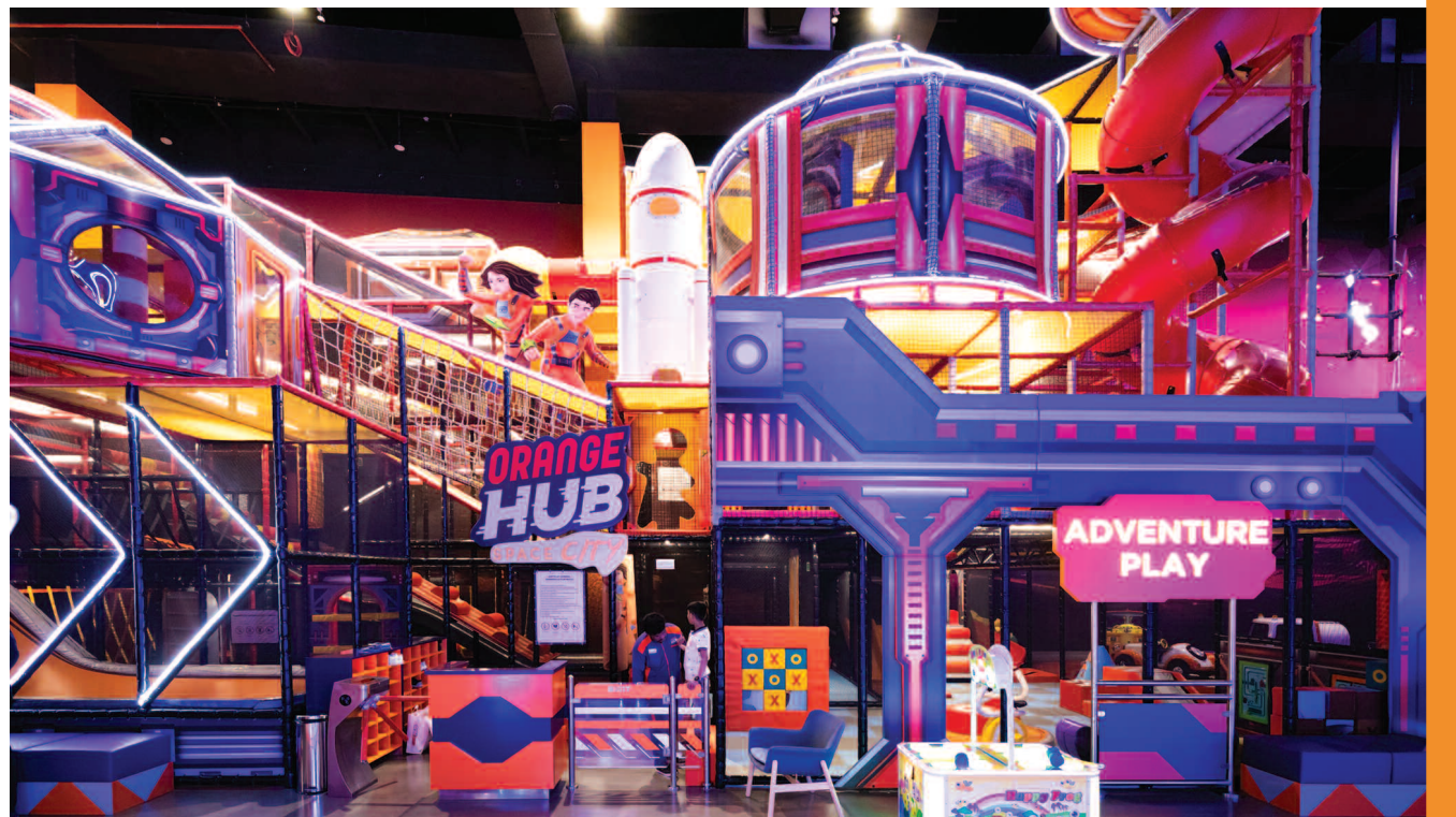
Orange Hub offers a range of dining options at the Orange Café, ensuring that parents can relax and enjoy while their children embark on thrilling adventures

With a diverse range of attractions including exhilarating rides, immersive VR experiences, and an extensive arcade featuring over 100 games, Orange Hub invites guests to jump on a journey of amusement and discovery