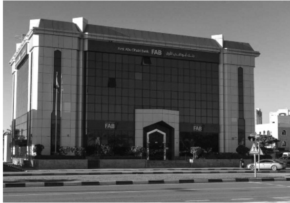
First Abu Dhabi bank continues to maintain strong liquidity and robust operational efficiencies, as highlighted in its 24% cost-to-income ratio