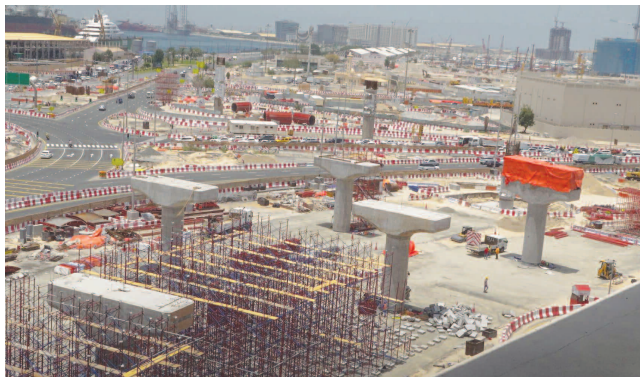
Al Shindagha Corridor Improvement Project included a two-lane tunnel extending 500 metres for left-turn traffic coming from Khalid bin Al Waleed Road heading to Al Mina Street with a capacity of 3,200 vehicles per hour