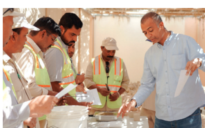
Titled Relearning with Earth, DCT's training programme helped 42 artisans and craftsmen refine their skills in restoring and preserving Abu Dhabi's earthen heritage sites