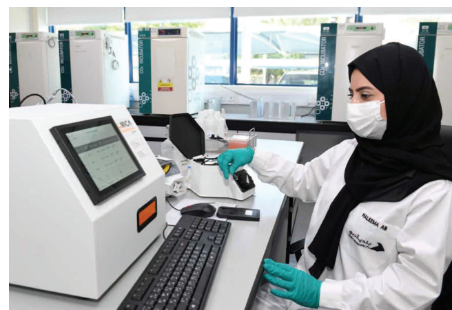
Dubai Central Laboratory (DCL) provides technical consultations, specialised training, and inspection and calibration services to ensure residents have access to high quality living conditions —WAM

In addition, the Acting Director of the Dubai Central Laboratory Department stated that more than 100,000 tests are carried out yearly by microbiological analysis laboratories on a variety of food types, environmental water, and consumer products (ISO/IEC 17025:2017) to guarantee the safety of goods sold in Dubai markets.