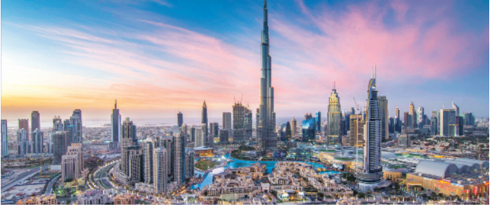
Hosted at the Museum of the Future and Emirates Towers in Dubai, the Food Innovation Conference 2024 brings together over 150 international experts, academics, local, regional and global private businesses and farmers, who will be taking part in various discussion panels