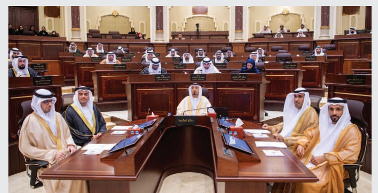
The SFRA, through its roles, aims to achieve four goals: preserving and developing fish resources in the Emirate; achieving and developing food security; reviving and advancing the fishing profession; and supporting cooperative shops by selling fishing materials at competitive prices —WAM