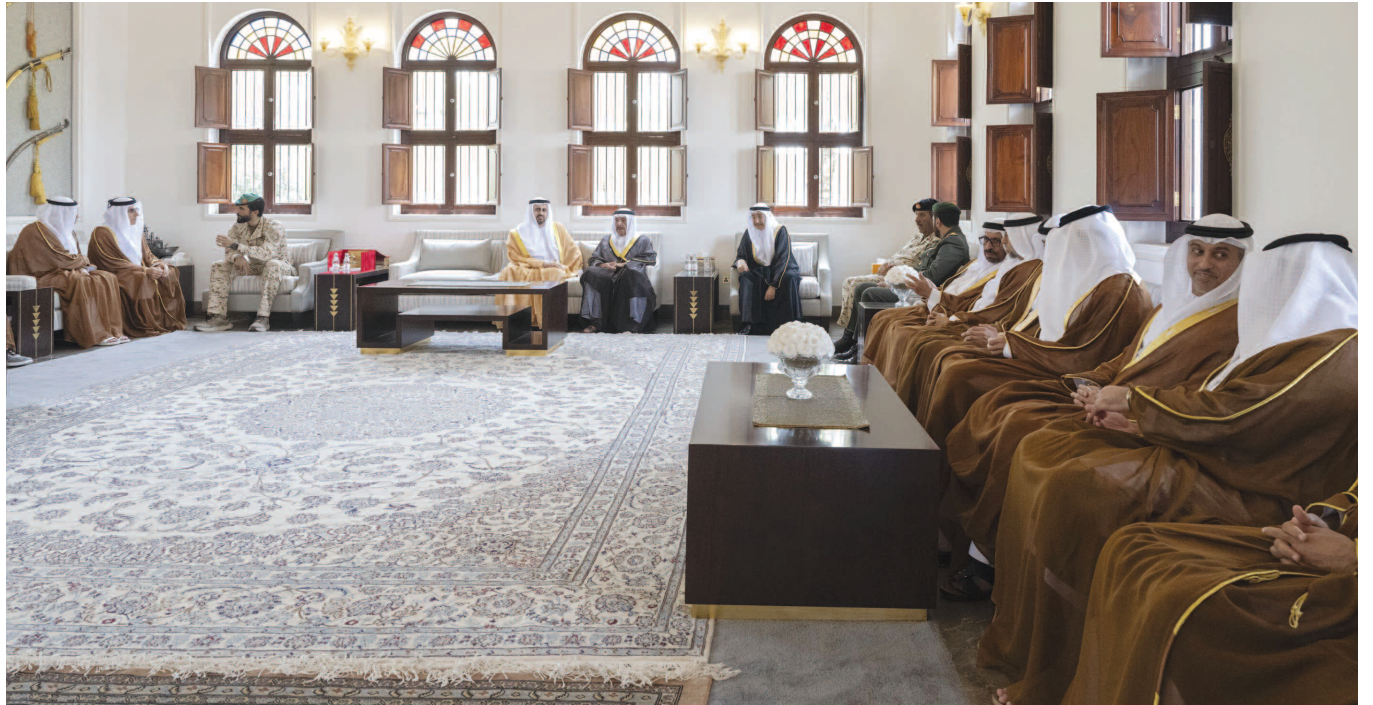
His Highness Sheikh Theyab bin Mohamed bin Zayed Al Nahyan, Deputy Chairman of the Presidential Court for Development and Fallen Heroes' Affairs, along with his accompanying delegation, during a reception hosted by Shaikh Khalid bin Ahmed Al Khalifa, Bahrain's Minister of the Royal Court, in Manama on Sunday

The delegation accompanying Shaikh Theyab bin Mohamed, including Abdul Rahman bin Mohammad bin Nasser Al Owais, Minister of Health and Prevention; Suhail bin Mohammed Al Mazrouei, Minister of Energy and Infrastructure; Dr Ahmad Belhouli Al Falasi, Minister of Education; Dr Abdulrahman Al Awar, Minister of Human Resources and Emiratisation; Abdullah Muhair Al Ketbi, Minister of Federal Supreme Council Affairs; Dr Thani bin Ahmed Al Zeyouidi, Minister of State for Foreign Trade; Ahmed Ali Al Sayegh, Minister of State; Khalifa Shaheen Al Marar, Minister of State; Hamad Mubarak Al Shamsi, Minister of State; Dr Sultan Alneyadi, Minister of State for Youth Affairs, and several officials, also offered condolences on the passing of Shaikh Abdullah bin Salman bin Khalid Al Khalifa.