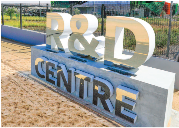
Dubai Electricity and Water Authority's research publications contribute to its efforts to enrich the local and international scientific community with specialised scientific research

Dubai Electricity and Water Authority (Dewa)'s research and development (R&D) centre published 73 Scopus-indexed scientific and research papers in 2023 in several international scientific conferences, peer-reviewed journals, and periodicals. This brings the total of scientific and research papers published by the centre to 221 until the end of last year.