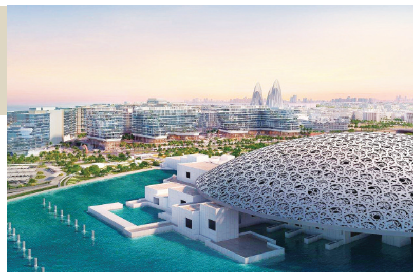
The fourth edition of 'Louvre Abu Dhabi Art Here' is inspired by the concept of Awakenings, and will be expanding to North Africa, alongside the GCC