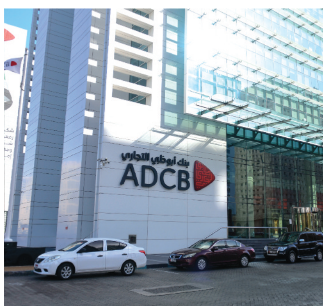
Abu Dhabi Commercial Bank (ADCB) has continuously invested in advanced technology to support its growing customer base while recognising the importance of personal interaction with customers

Abu Dhabi Commercial Bank (ADCB) ranked as the top financial institution for customer experience excellence and the second across all sectors in the latest annual survey conducted by KPMG Lower Gulf. According to the KPMG's annual Customer Experience Excellence (CEE) report: Adcb's rise in the KPMG Customer Experience rankings is a testament to its holistic approach to customer satisfaction, one that combines excellent service, diverse product offerings, technological innovation, operational efficiency, and a strong focus on security and trust.