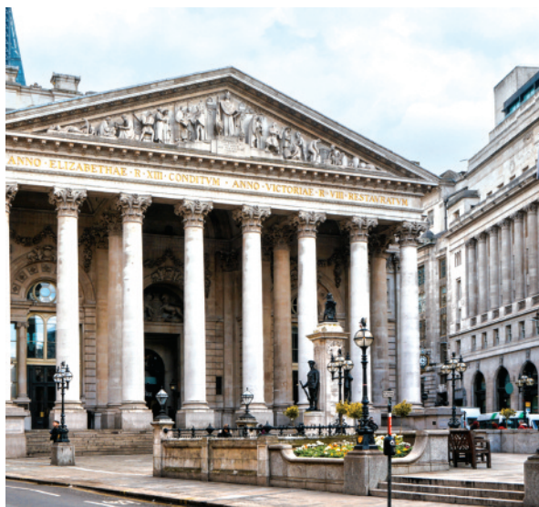
As of December 31 2023, Abu Dhabi Developmental Holding Company's total assets amounted to US$196 billion

The proceeds from the offering will serve as growth capital and facilitate further investments in strategic initiatives that contribute to the realisation of ADQ's mandate and expansion in key sectors, driving economic prosperity in Abu Dhabi and beyond.