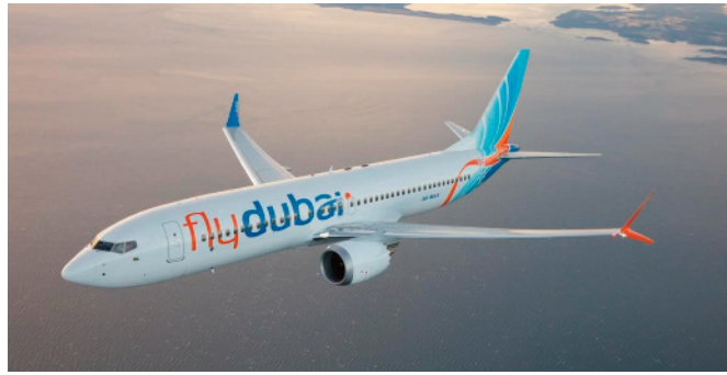
flydubai's fleet consists of 29 Next-Generation Boeing 737-800, 54 Boeing 737 MAX 8 and 03 Boeing 737 MAX 9 aircraft

Since the start of 2024, flydubai has further expanded its network with the start of operations to Al Jouf, Langkawi, Mom-basa, Penang and The Red Sea.