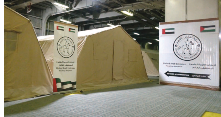
Equipped with advanced surgical and intensive care units, emergency services, radiology, and support facilities, including laboratories and pharmacies, the UAE Floating Hospital provides vital medical services