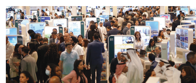
By tracking indicators such as consumption of fuel, gas, electricity, and water and converting this data into a standardised unit of measurement (kgCO2e), the Carbon Calculator facilitates analysis across the hotel industry

The calculator's methodology has been developed in consultation with representatives