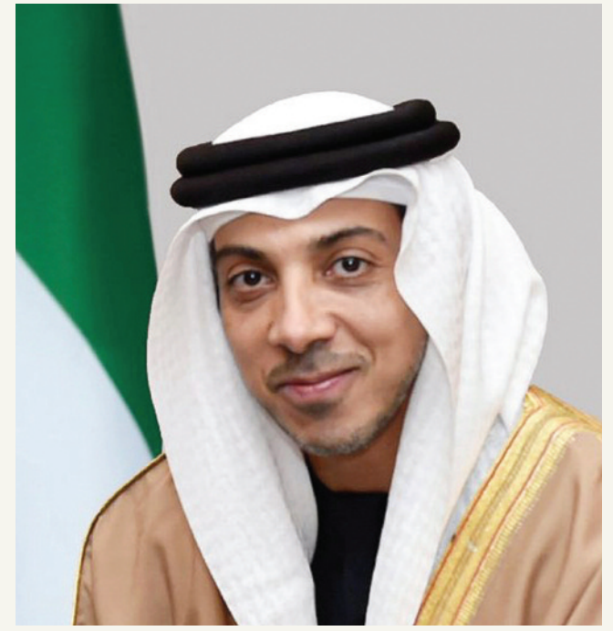
ABU DHABI

UAE President His Highness Sheikh Mohamed bin Zayed Al Nahyan has sent a message of condolences to President Luiz Inácio Lula da Silva of Brazil over the victims of the floods caused by heavy rains in southern Brazil, wishing a speedy recovery to all the injured.