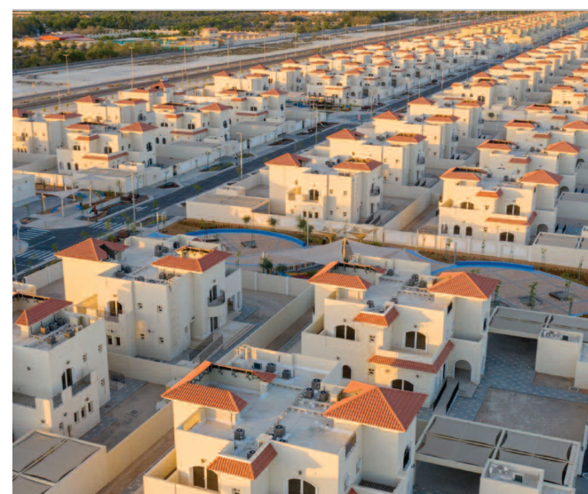
Abu Dhabi Housing Authority underscored that committee decisions shall be final, with no requests accepted beyond the designated deadline

In the case of exchange with other citizens, the exchange criteria outlined in the updated housing programmes and housing benefits policies in the emirate of Abu Dhabi are applicable, along with written