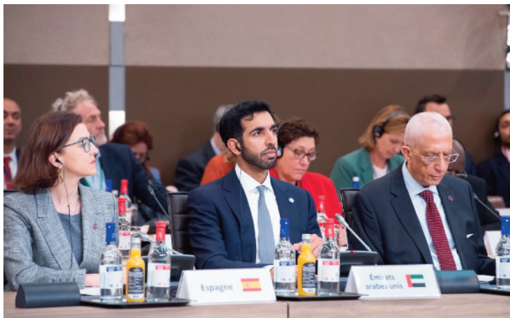
Sheikh Shakhboot bin Nahyan Al Nahyan, UAE's Minister of State, during a meeting at International Humanitarian Conference for Sudan in Paris on Wednesday

The UAE called for a return to the political process in Sudan, and affirmed the importance of global and regional collaboration to advance endeavours towards permanent truce