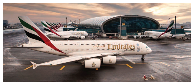
In a statement, Dubai Airports said that flights continue to be delayed and diverted. Passengers are advised to contact their respective airlines for the latest information on flight status —WAM

Airlines has decided to suspend travel procedures for passengers departing from Dubai starting from 8:00 am on Wednesday, April 17, until midnight on April 18, due to operational challenges resulting from adverse weather conditions and road conditions.