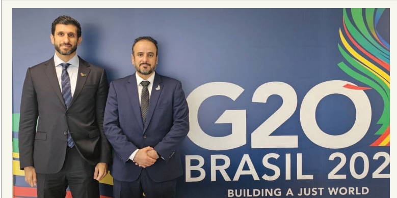
The UAE delegation showcased the country's tangible efforts, including the $200 million pledge to the Resilience Sustainability Trust to support climate resilience in vulnerable countries and advance sustainable finance efforts —WAM