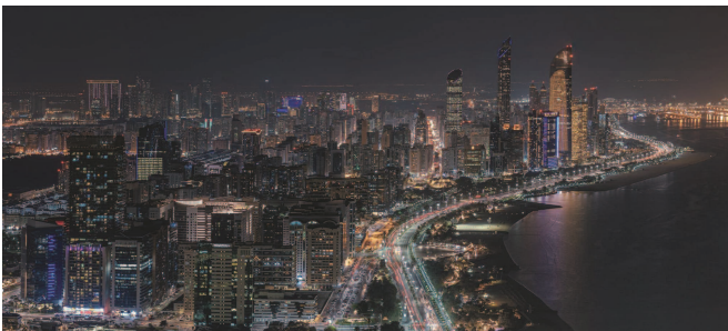
The AVPN Global Conference 2024 builds on the success of the 2023 edition, which saw more than 1,300 attendees from more than 44 markets engage in the global discourse, and the launch of various frameworks, papers and initiatives —WAM

Reem bint Ebrahim Al Hashimi, Minister of State for International Cooperation and member of the International Humanitarian and Philanthropic Council, said, "The UAE knows first-hand that shared challenges require shared solutions. In hosting the AVPN Global Conference 2024, we further our commitment to building a better