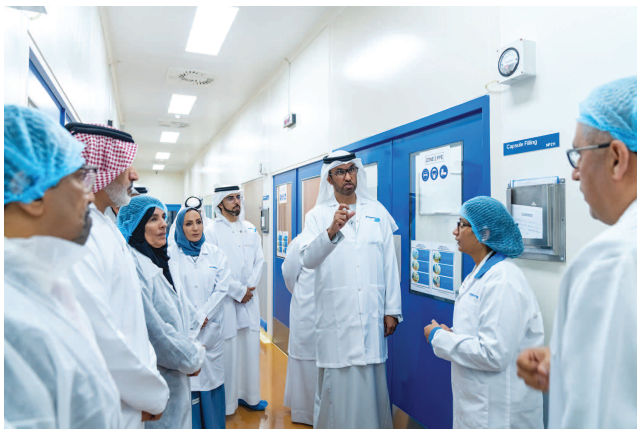
Global Pharma owns three manufacturing facilities equipped with the latest technologies, manufacturing pharmaceuticals for the Middle East and North Africa region. The company achieved a high rating in the Industrial Technology Transformation Index

The delegation was also briefed on Global Pharma's efforts to forge partnerships with local, regional, and international entities, including the Industrial Partnership for Sustainable Economic Development under the umbrella of the Ministry of Industry and Advanced Technology (MoIAT), with the aim of boosting the competitiveness of