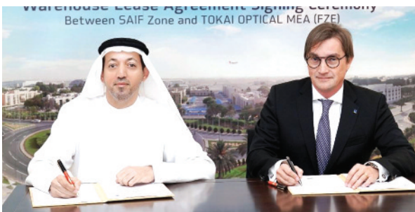
The SAIF Zone pact marks the first phase of Tokai Optical's expansion in SAIF Zone, representing an investment of around AED8 million —WAM

Under the terms of the memorandum of understanding (MoU), Tokai Optical will lease a warehouse covering approximately 4,300 square feet within the Free Zone. This marks the first phase of Tokai Optical's expansion in SAIF Zone, representing an investment of around AED8 million.