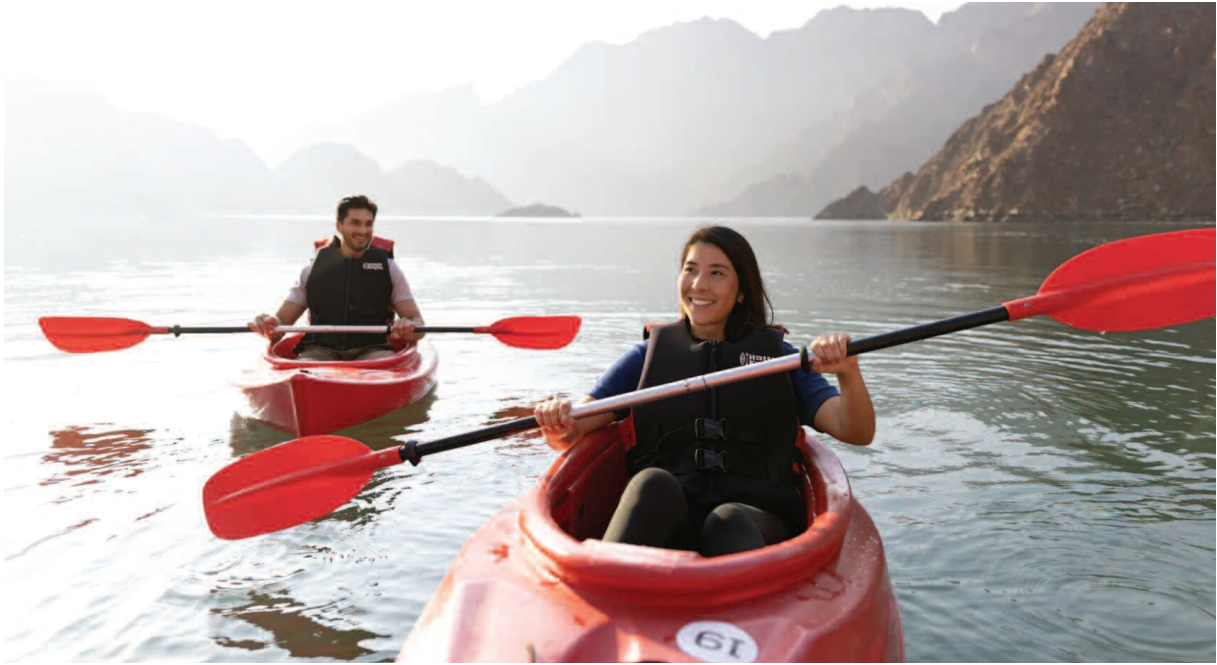
Dubai SME has supported the issuance of 45 fee-exempt commercial licences for startups in Hatta to date. This unwavering backing has encouraged entrepreneurial activities in the region, reducing entry barriers for new businesses, and promoting economic innovation