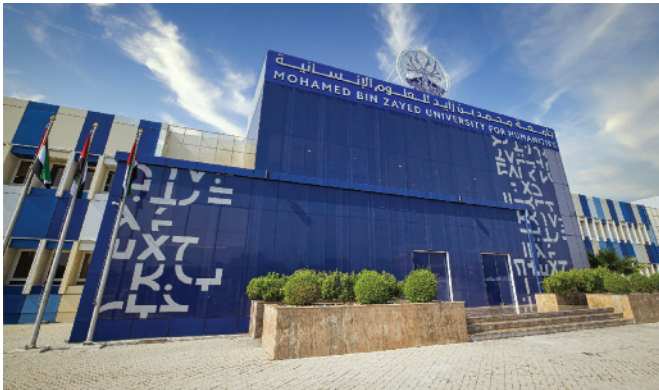
Titled "Philosophy and the Challenge of Theoretical and Social Progress," the event will run from February 6-7, bringing together thinkers and academics from around the world