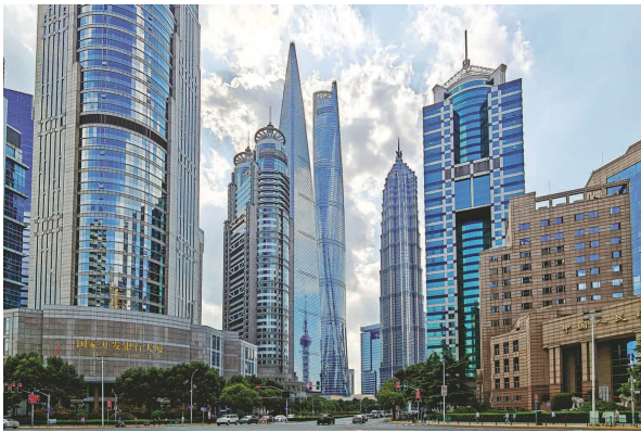
The number of licenced financial institutions in Shanghai had reached 1,771 by the conclusion of the previous year, with foreign financial institutions representing over 30% of that figure, according to a report by China Daily . —WAM

Relying on key areas, such as Pudong New Area and Lingang New Area, the city will carry out financial stress tests to a greater extent, build a trading platform for international financial as-