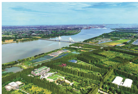
The Yangtze River Delta region, taking up only 4% of China's land area, contributes about 25% of mainland's total GDP. —WAM

According to a report by China Daily , the number of licenced financial institutions in Shanghai had reached 1,771 by the conclusion of the previous year, with foreign financial institutions representing over 30 percent of that figure.