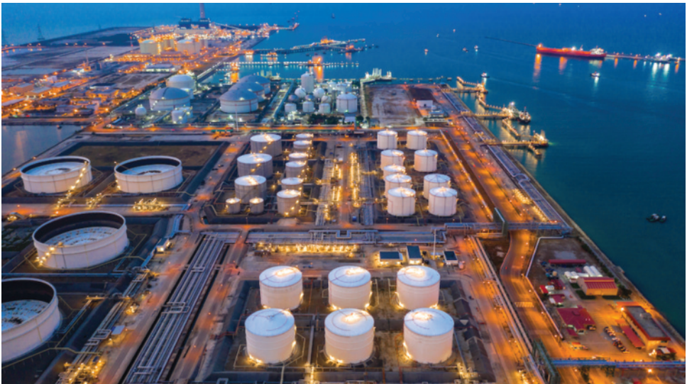
LNG buyers in Japan, the world's second biggest importer of the super-chilled fuel, are actively selling shipments because they have too much. Some of those cargoes are likely to make their way to Europe

While there are pockets of demand, particularly in India and China, those purchases are pri-