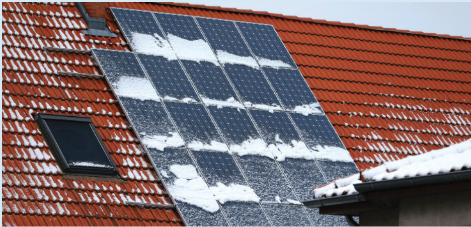
Solar has been at the forefront of Europe's renewables expansion in recent years due to plummeting costs, but the trend has come at the expense of European panel producers who haven't managed to scale up supply chains sufficiently

A key factor that complicated matters was the US's 2022 ban on panels with components from China's Xinjiang region. The move aimed at ruling out forced labour, but caused equip-