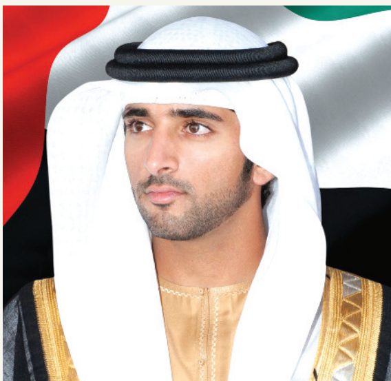
DUBAI / WAM

HH Sheikh Hamdan bin Mohammed bin Rashid Al Maktoum, Crown Prince of Dubai and Chairman of Dubai Executive Council, launched the 'Dubai International Growth Initiative', allocating AED500 million to accelerate the expansion of small and medium-sized enterprises (SMEs) established in Dubai into global markets. The initiative was launched by the Government of Dubai in partnership with Emirates National Bank of Dubai