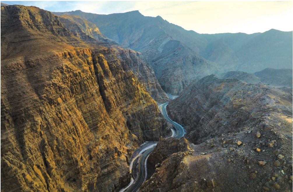
Launched under the slogan ‘Unforgettable Stories, the nationwide campaign offers a wide range of options that cater to the diverse interests of domestic and international travelers, enabling them to create memorable experiences in the UAE

Launched under the slogan ‘Unforgettable Stories, the nationwide campaign offers a wide range of options that cater to the diverse interests of domestic and international travelers, enabling them to create memorable experiences in the UAE. The ‘World’s Coolest Winter’ campaign website showcases the UAE’s hidden gems, attractions, camping spots, extreme activities, hiking trails, cycling routes, best islands, beaches, theme parks, museums places, bazaar markets, and children’s activities. UAE’S HIDDEN GEMS The hidden gems listed on the website include Al Ain Oasis, Al Qudra Lakes, Hatta Secret Pool, Khor Kalba Mangrove Center, the Buried Village in Sharjah, Al Madam, Al Suhub Rest Area, House of Wisdom, Umm Al Quwain Mangrove Beach, Wadi Abadilah, Ras Al Khor Wildlife Sanctuary, Sharjah