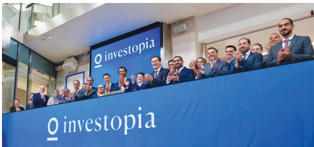
Abdulla bin Touq Al Marri, Minister of Economy and Chairman of Investopia, during a visit to the LSE headquarters in London on Wednesday

Julia Hogget, CEO of the London Stock Exchange, received him in the presence of Michael Mainelli, Lord Mayor of the City of London, and several