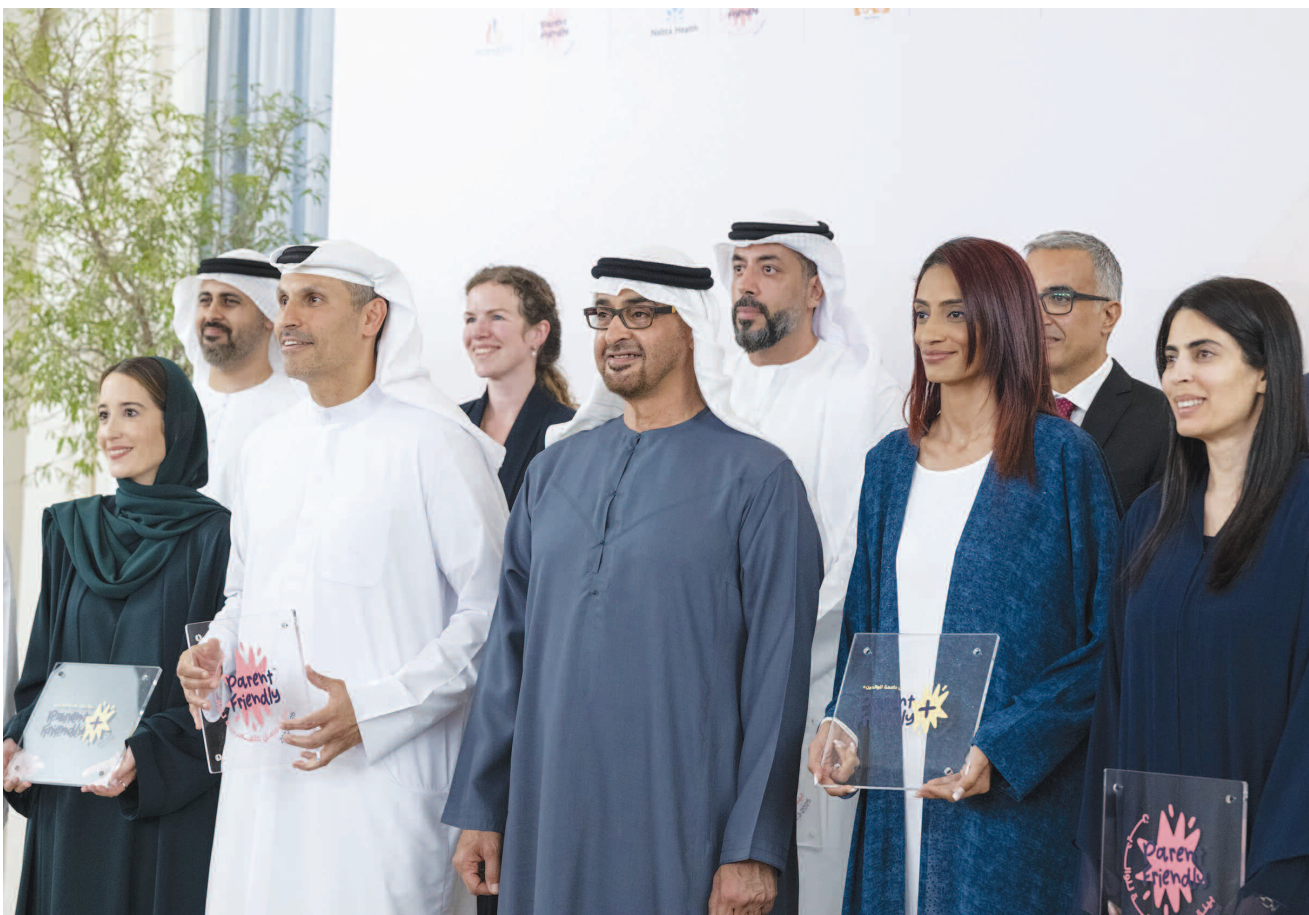
UAE President His Highness Sheikh Mohamed bin Zayed Al Nahyan during an event to honour institutions awarded the prestigious Parent-friendly Label (PFL) by the Abu Dhabi Early Childhood Authority (ECA) at Qasr Al Shati in Abu Dhabi on Wednesday

His Highness Sheikh Mohamed bin Zayed Al Nahyan expressed his appreciation to all the institutions participating in the programme for their commitment to adopting a parent-supportive work culture