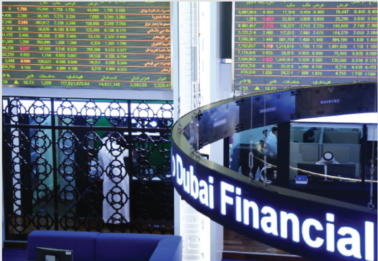
The general index of the DFM increased by 2.69% in January, equivalent to more than 109 points, closing at 4169.08 points compared to its year-end level of 4059.8 points —WAM

billion in the Abu Dhabi market and AED7.9 billion in the Dubai market. Trading involved over 8.83 billion shares in more than 498,700 transactions. The general index of the DFM increased by 2.69% in January, equivalent to more than 109 points, closing at 4169.08 points compared to its year-end level of 4059.8 points. Dubai's market gains were driven by the rise of the telecommunications sector index by 8.86%, the financial sector by 6.06%, industry by 3.25%, and services by 1.07%. At the end of the month, the Abu Dhabi market index, 'FADX 15,' closed at 9330.92 points, while the general Abu Dhabi market index, 'FADGI,' closed at 9508.32 points.