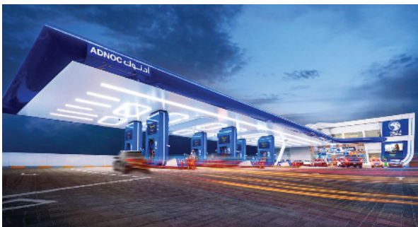
Adnoc Distribution will focus on key strategic priorities in 2024, that include achieving profitable growth, seamlessly integrating sustainability into its operations and fostering a culture of customer experience excellence —WAM

Adnoc Distribution continued to expand its network in 2023, surpassing its annual target of 25-35 new stations by opening 41 service stations across the